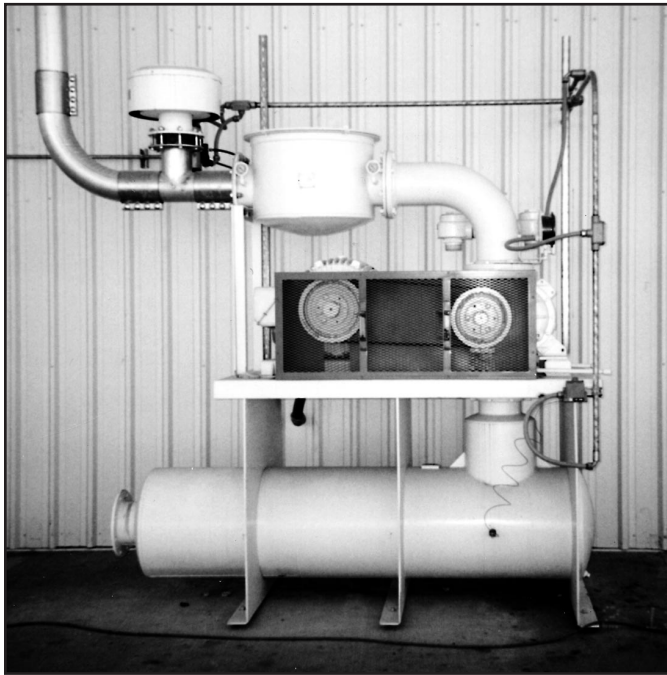
Railcar Unloader Vacuum Loader Unit

Each customer has their own special requirements for material convey rates and storage capacities. We design and build each system from standard components combined specifically to achieve the results that you require. Your needs will determine whether a vacuum batch, continuous vacuum or pull/push system is best in your application.