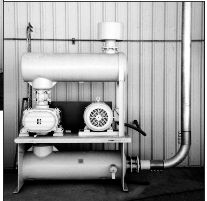
Railcar Unloader Pressure Blower Unit