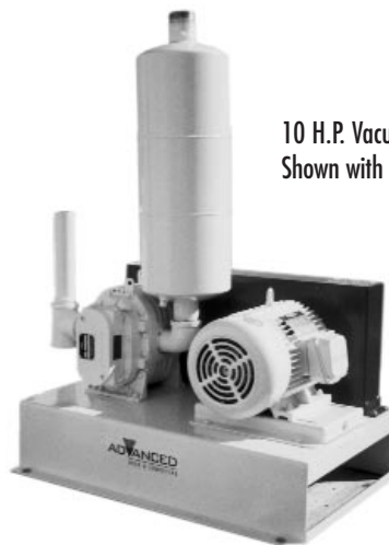
10 H.P. Vacuum Loader Shown with URB Silencer.