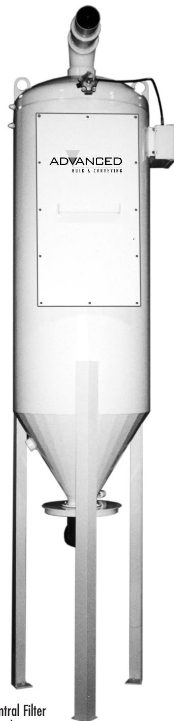
Self-Cleaning Central Filter shown with optional automatic dump flapper valve.